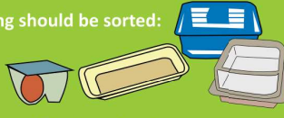
Plastic and polystyrene trays